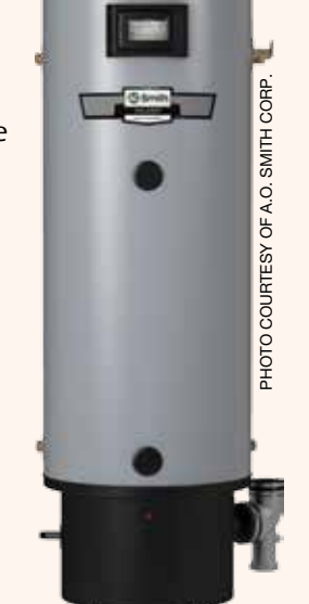
A. O. Smith Corp.'s new line of highly efficient condensing residential Polaris series boasts up to 96 percent thermal efficiency.

The stainless steel tank and heat exchanger used in Polaris units ensure years of reliable performance and durability. High-