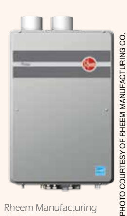
Rheem Manufacturing Co.'s Prestige Series condensing tankless gas water heaters include a water savings setting that can save up to 1,100 gallons per year.

Rheem offers both tank and tankless natural gas water heaters. Rheem Prestige Series condensing tankless gas water heaters include a water savings setting that can save up to 1,100 gallons per year. It achieves this by reducing water flow at the tap until a preset temperature is achieved. Another feature known as the overheat film wrap eliminates the possibility of temperatures rising to dangerous levels. Additionally, hot-start programming maintains the Rheem Prestige in a ready-fire state. Instead