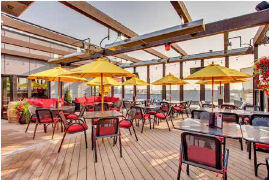
Restaurant owners turned to outdoor heaters to expand their dining spaces during the COVID pandemic.

how to make the outdoor dining space profitable. Those with access to natural gas were able to take advantage of the cost and energy efficiency of natural gas heaters to expand their outdoor dining season.