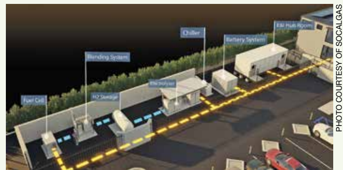
Hydrogen Home will be powered by 100% clean energy including hydrogen, batteries and solar power.

The utility also plans to establish the nation's largest green hydrogen energy infrastructure. Known as Angeles Link, the system could displace up to 3 million gallons of diesel per day, helping to eliminate hazardous air pollutants, and could allow natural gas power plants in the region to convert to green hydrogen. ■