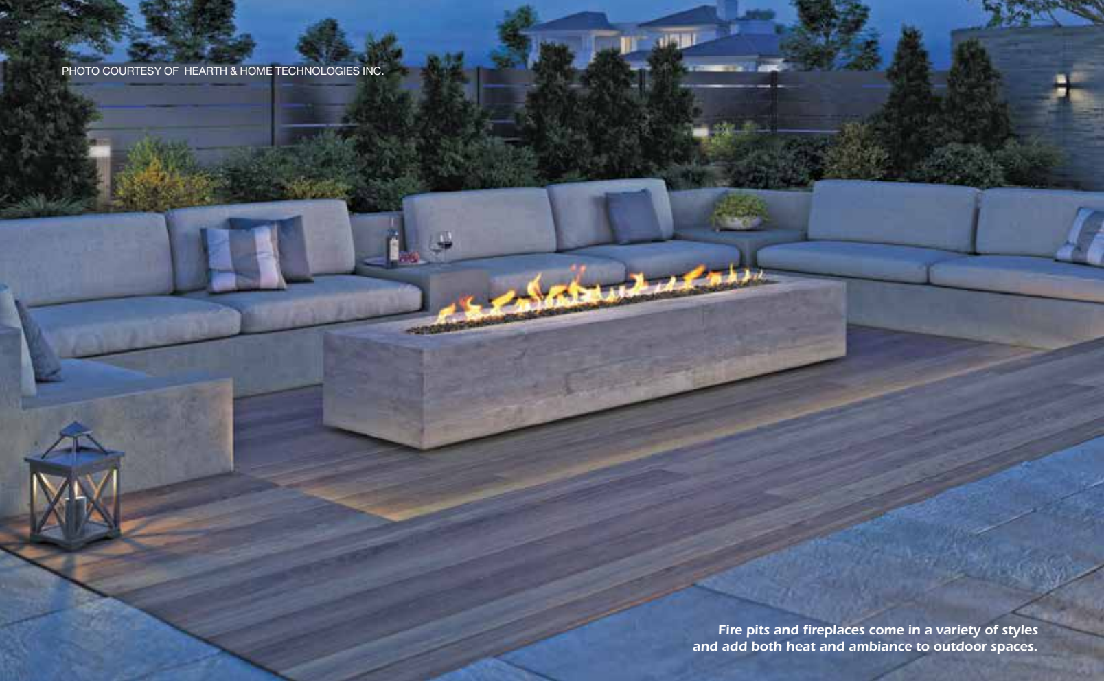
Fire pits and fireplaces come in a variety of styles and add both heat and ambiance to outdoor spaces.

fuel source. Natural gas is both affordable and environmentally friendly.