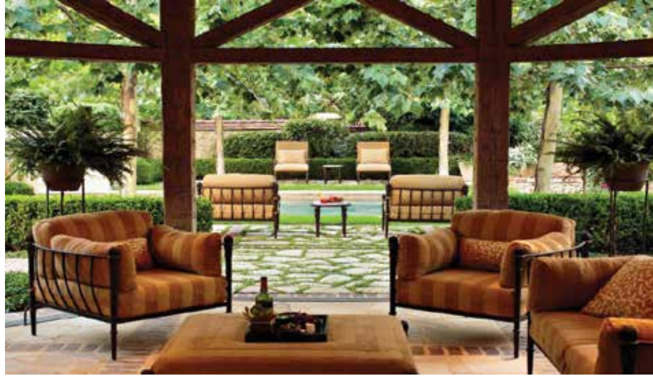
Outdoor living spaces and the use of natural gas design elements are two key trends for spring and summer 2021 .