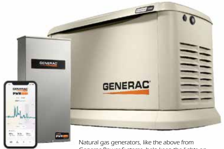
Natural gas generators, like the above from Generac Power Systems, help keep the lights on and appliances working during a power outage.

Prices for natural gas generators chiefly depend upon size and in-