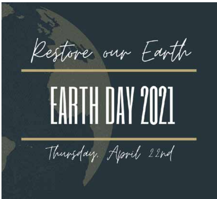
The theme of this year's Earth Day, which takes place April 22, is “Restore the Earth.” Clean-burning natural gas plays a significant role in helping to preserve the environment.

The U.S. Department of Energy analyses indicates that every 10,000 U.S. homes powered with