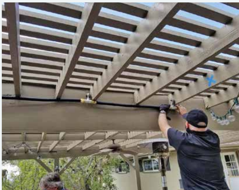
Corrugated Stainless Steel Tubing, or CSST, is an ideal match for outdoor rooms because its flexibility allows it to be installed in a variety of configurations to meet design needs.

"CSST allows you to create an infrastructure that is easy to install, is low maintenance and can give you flexibility," he said. "Depending on how big your outdoor use is going to be, you can set up as simple or as complex an arrangement as you need with relatively low cost and fast installation. I see CSST and outdoor lifestyles as a great partnership with consumer features, smart technologies and innovative, adaptable piping systems." ■